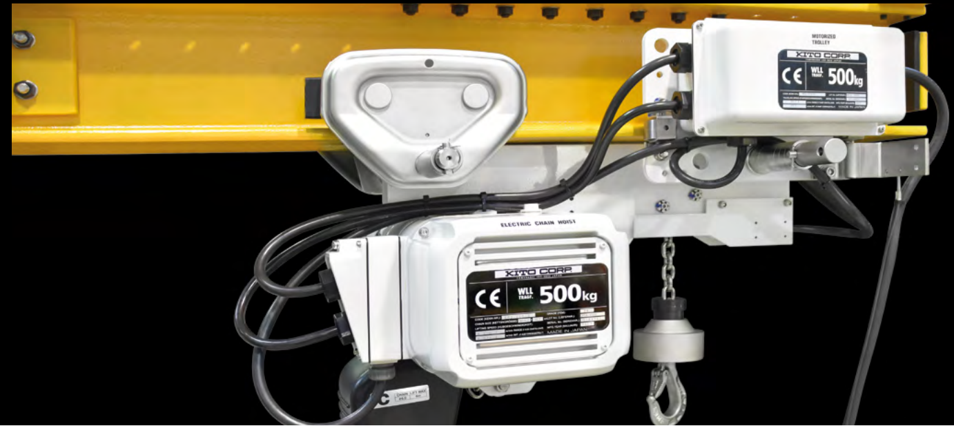
FER2 FOOD GRADE ELECTRIC CHAIN HOIST Low Headroom