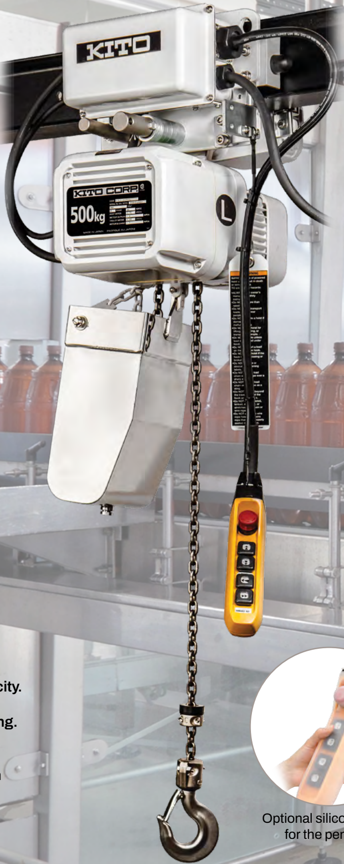
Optional silicone cover for the pendant