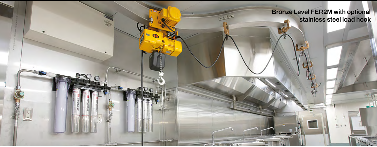
Bronze Level FER2M with optional stainless steel load hook