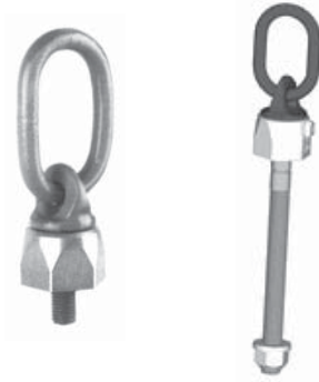
Lifting points bolted WBG-V / WBG

This safety instruction / declaration of the manufacturer has to be kept on file for the whole lifetime of the product.